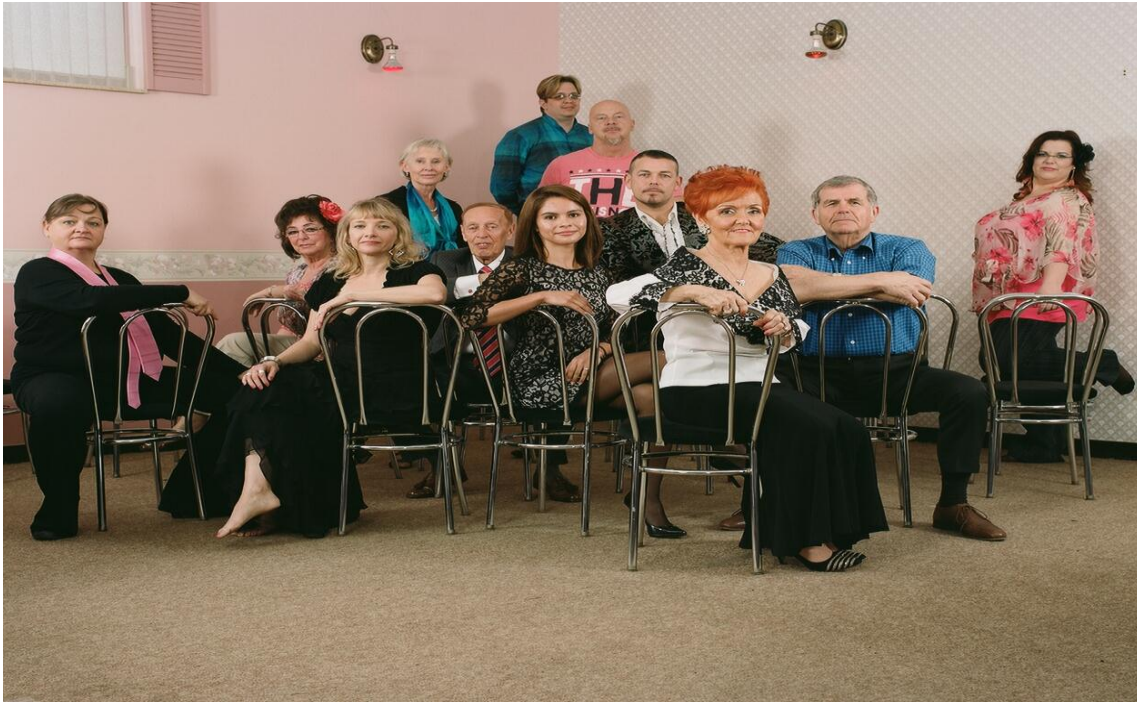
TORNER FAMILY EXTENDED